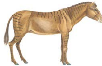
Parahippus & Merychippus