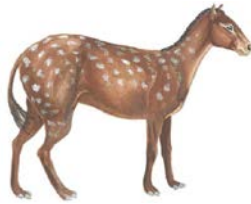
Mesohippus & Miohippus