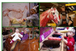
The Interactive Youth Education Attraction for Horse Lovers!