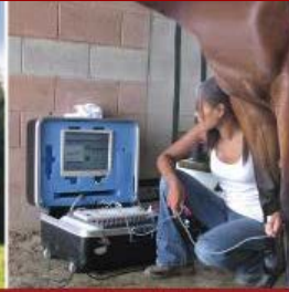
funding industry research