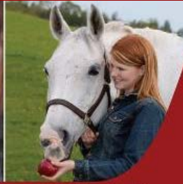
promoting health & performance