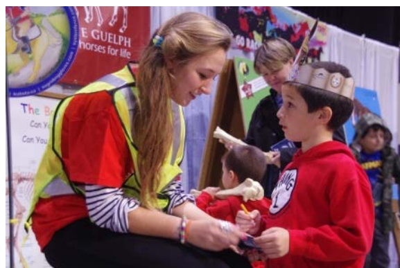
Volunteer at EquiMania!

Promote your barn in our booth by joining our team of EquiMania! volunteers! You can bring a barn poster or banner and brochures to display at our exit and we will provide a sign at our entrance thanking your barn for providing volunteers. You may also wear your barn shirts, jackets and hats during the four hour volunteer shift.