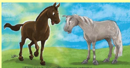
COPYRIGHT © 2014 by CELESTINE WILSON. ALL RIGHTS RESERVED. A CONNECTION BY