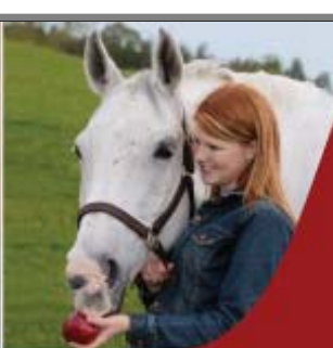
promoting health &amp; performance