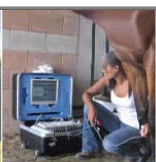
funding industry research