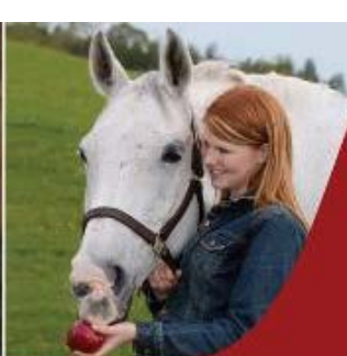
promoting health & performance