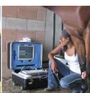
funding industry research