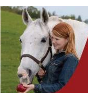
promoting health & performance