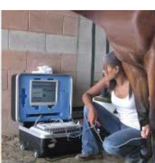
funding industry research