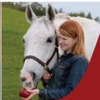
promoting health & performance