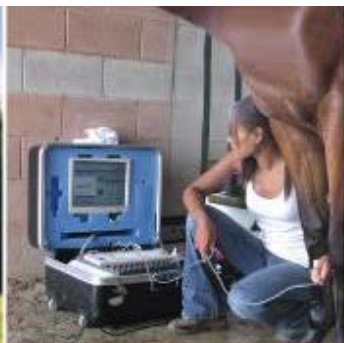
funding industry research