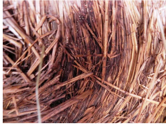
Round bales not recommended as they provide an environment where mould can take hold