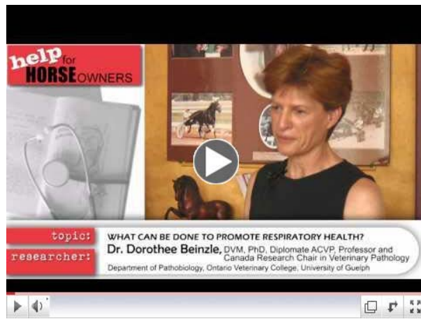
Promoting respiratory health