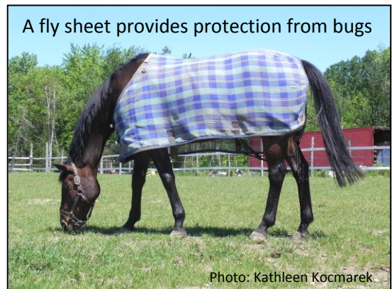
A fly sheet provides protection from bugs

If the fly can't land on your horse, it can't bite your horse! Fly masks and sheets are great way to protect your horse from flying pests. Belly, neck and leg guards are also available. These are a great alternative for horses that have reactions to topical repellents. However, fly sheets and masks can become too hot in the summer sun, so it is important to make sure the horse does not become overheated.