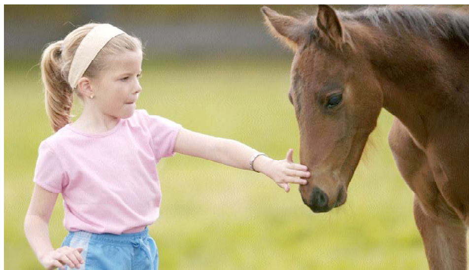
Equine Guelph's educational programs are designed to nurture our passion for horses with lifelong learning for recreational riders and industry professionals.