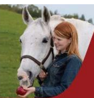
promoting health & performance