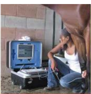
funding industry research