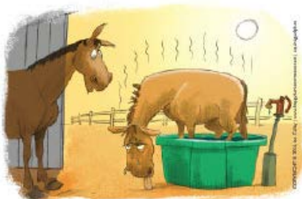
"I WAS GOING TO DRINK THAT. ... UH, NEVER MIND."